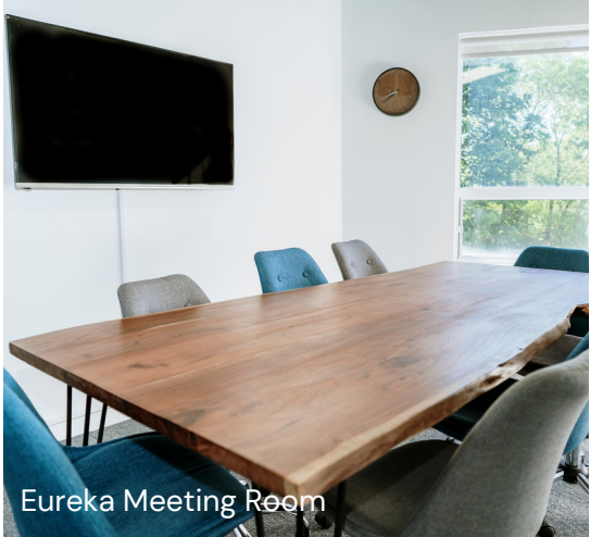
Eureka Meeting Room