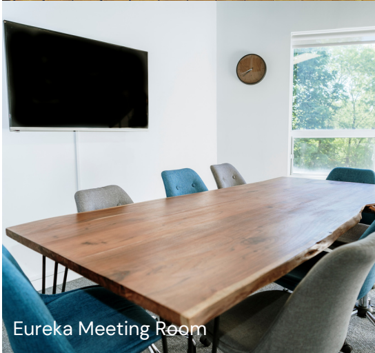
Eureka Meeting Room